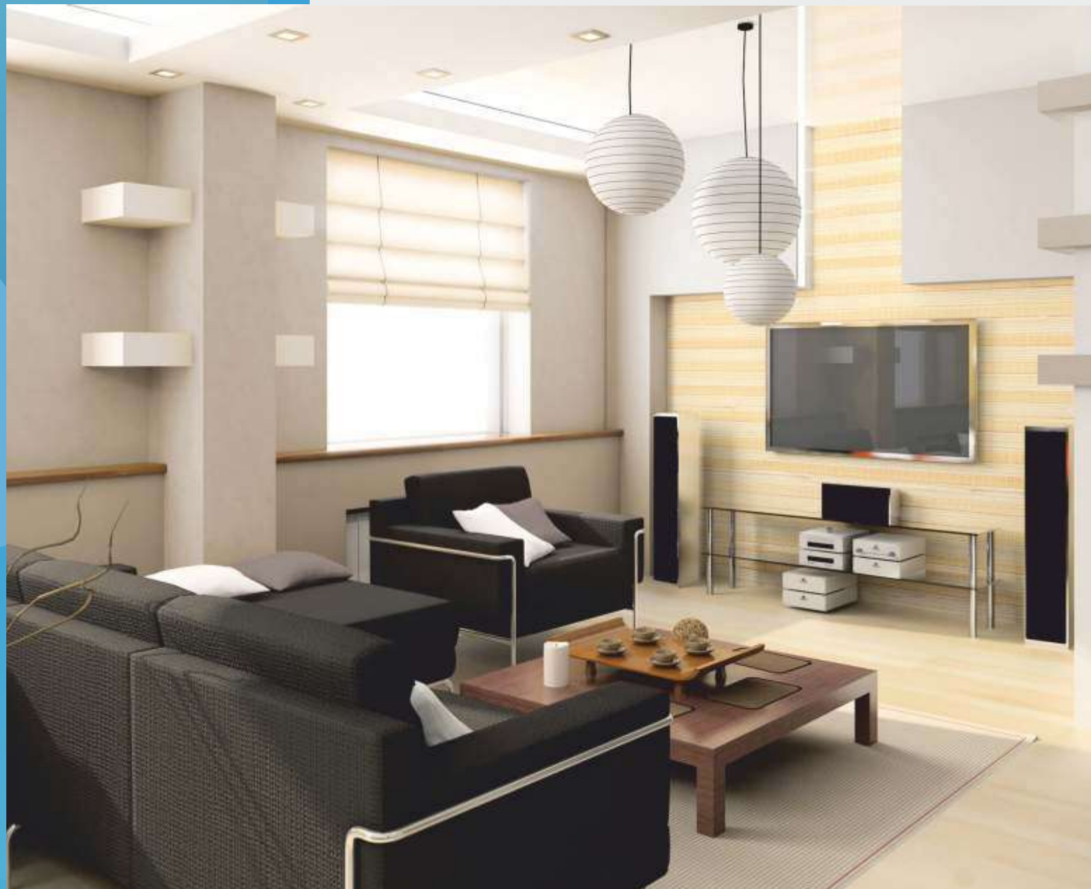
A Delightful lifestyle!

Each residence in Aranya is an engrossing living space designed to provide every conceivable luxury and spellbinding views.