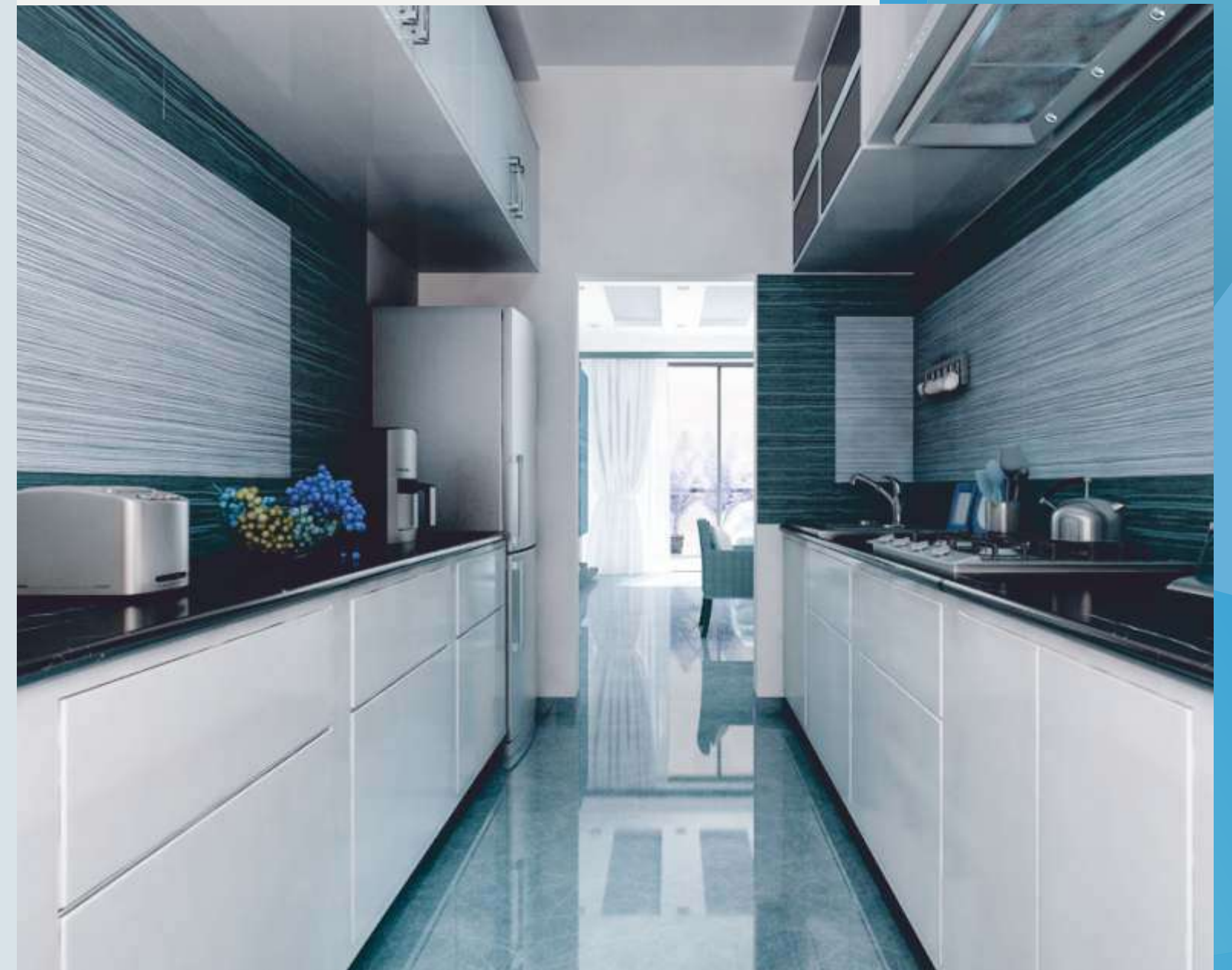
Here relationships will get alive!