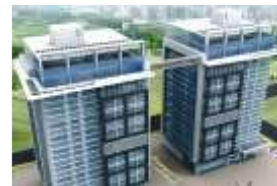
UDB Corporate Towers