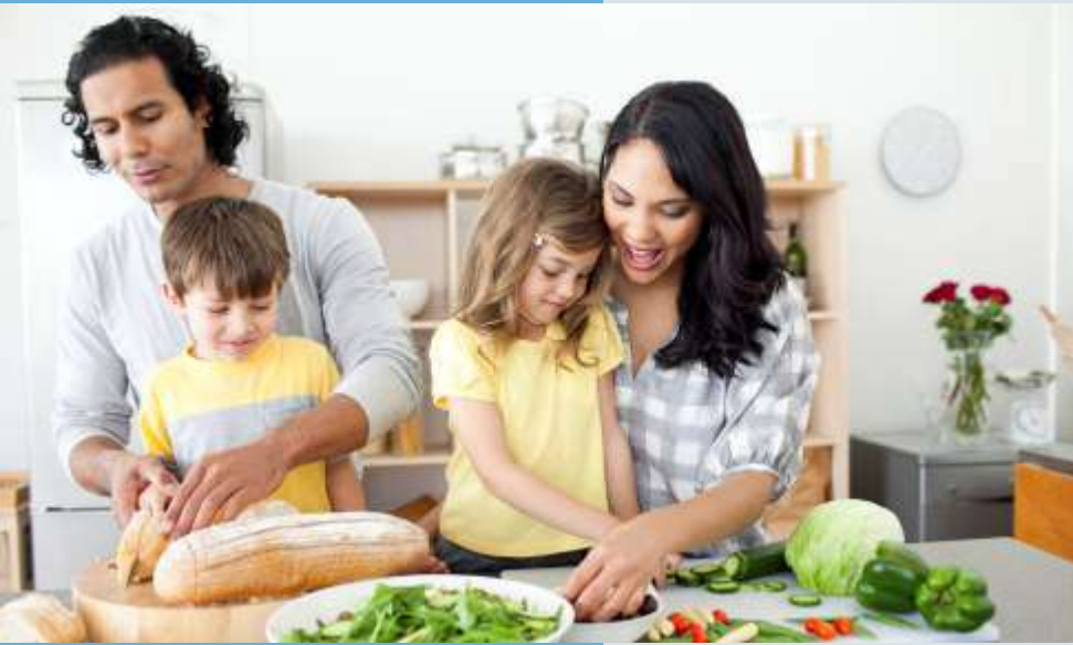
Where Eating is a Festival...